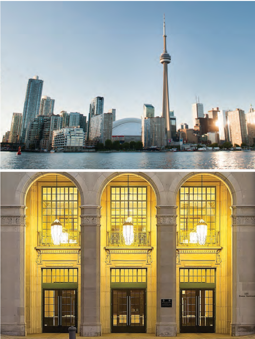
Beanfield Centre 100 Princes' Blvd, Toronto, ON M6K 3C3

The Beanfield Centre is one of Canada's greenest conference centres. The 160,000 square foot facility features 100% green power from renewable sources, and incorporates today's most advanced technological innovations.